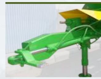
FRONT SUPPORT AND HYDRAULIC DIRECTIONAL CONTROL SHAFT