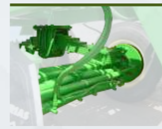
STEERING REAR AXLE