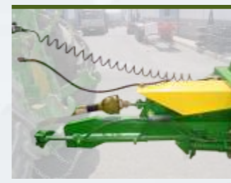
HYDRAULIC EQUIPMENT, INDEPENDENTLY OPERATED THROUGH TRANSMISSION